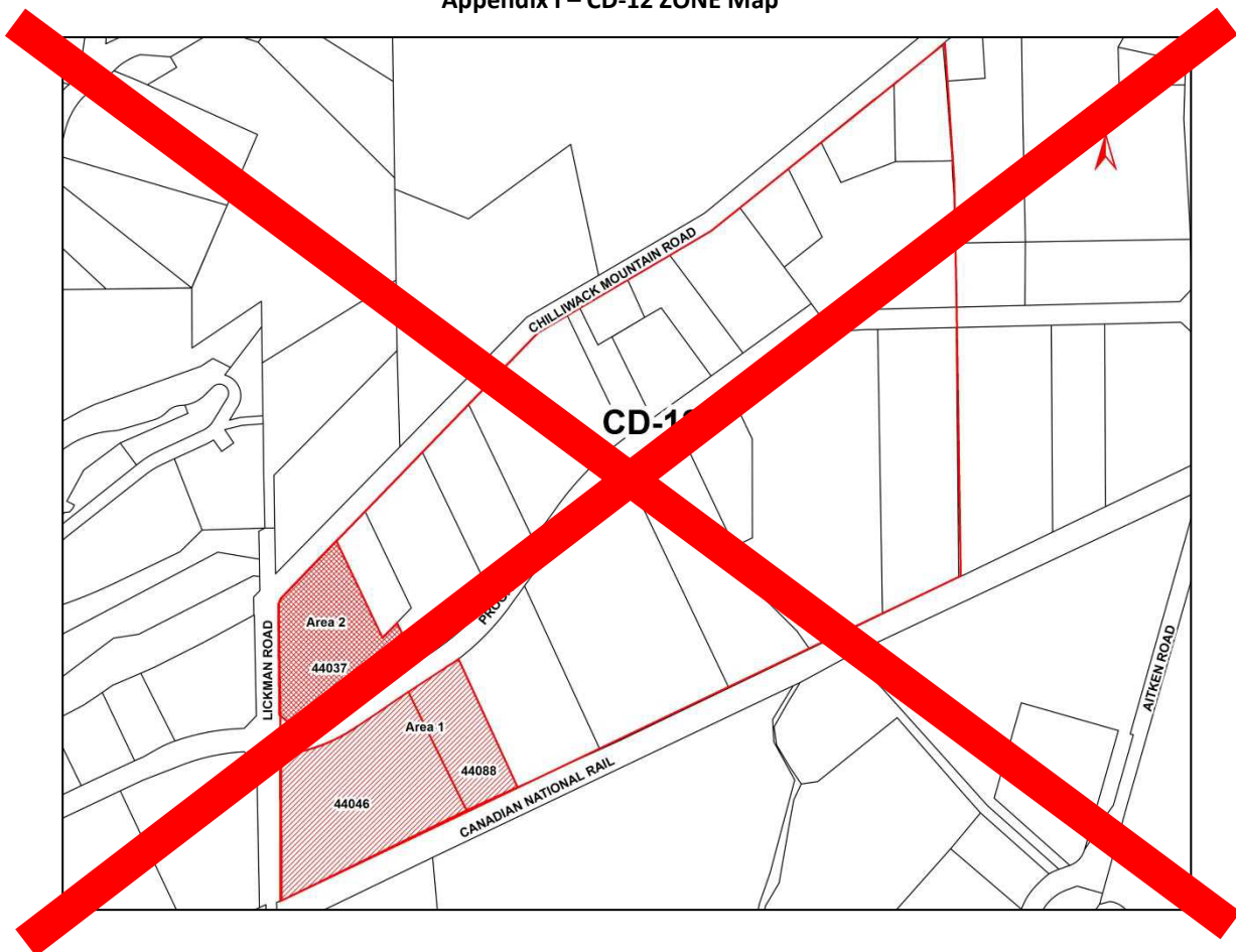
“Appendix I – CD-12 ZONE Map”

Review General Regulations for Additional Development Requirements.